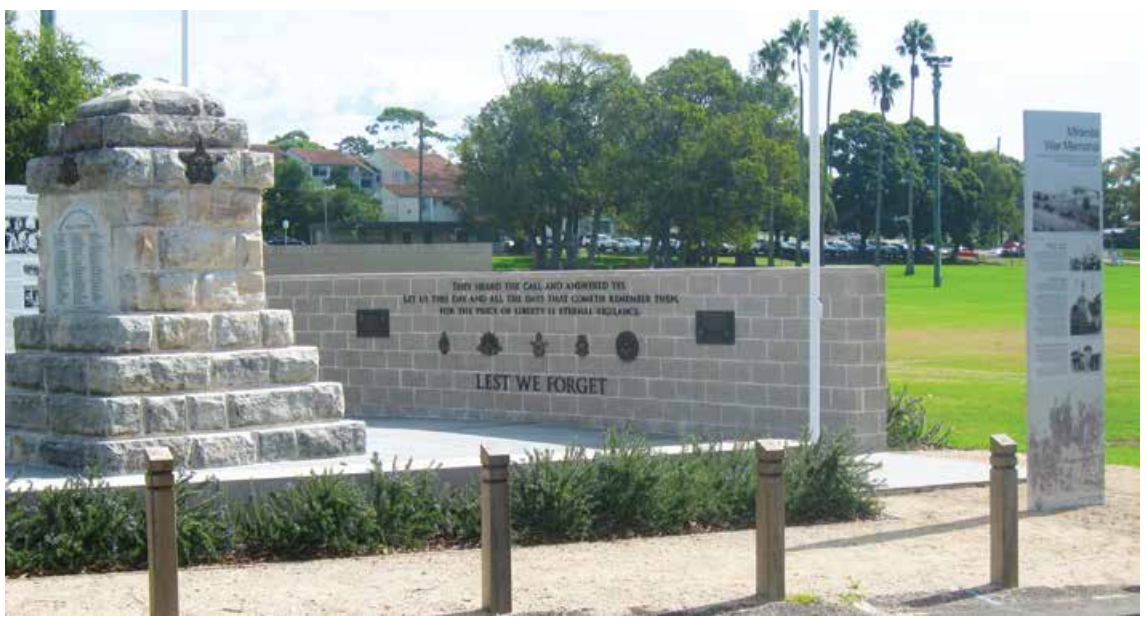
Miranda War Memorial

Supply and installation throughout Australia